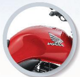
Imperial Red Metallic