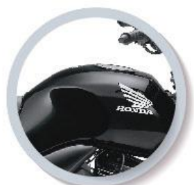
Pearl Igneous Black

Dealer Stamp Jai Shyam Honda Dhanora Road Gadchiroli Tel: 8605021825 Mob: 9168533083