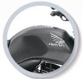
Matt. Axis Grey Metallic