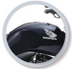
Pearl Siren Blue