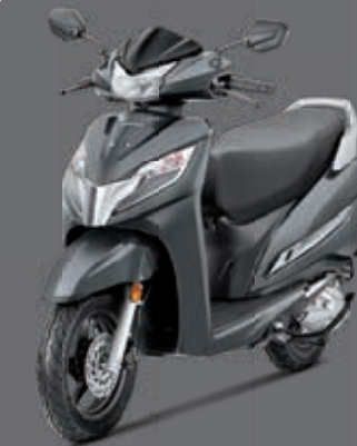
HEAVY GRAY METALLIC