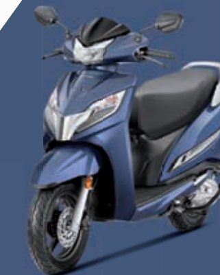
MIDNIGHT BLUE METALLIC