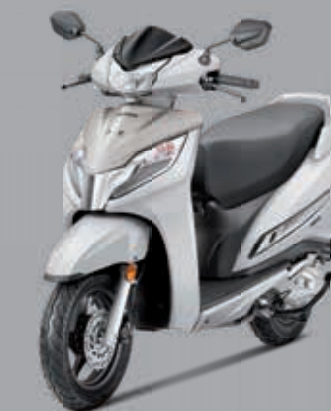
PEARL PRECIOUS WHITE WITH SALEN SILVER METALLIC