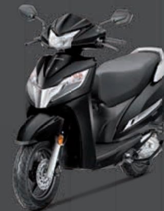
PEARL NIGHT STAR BLACK